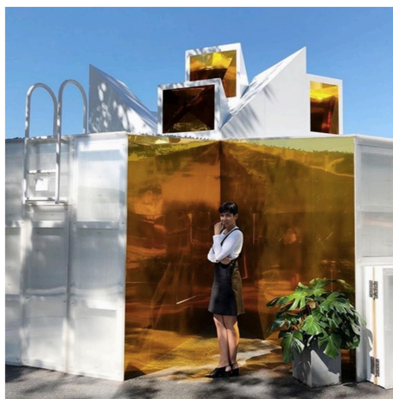
Back home but #bejingdesignweek is something to share again and again. The Urban Cabin located in Beijing is one part of building a global village in the world and is the fourth cabin built by MINI LIVING.