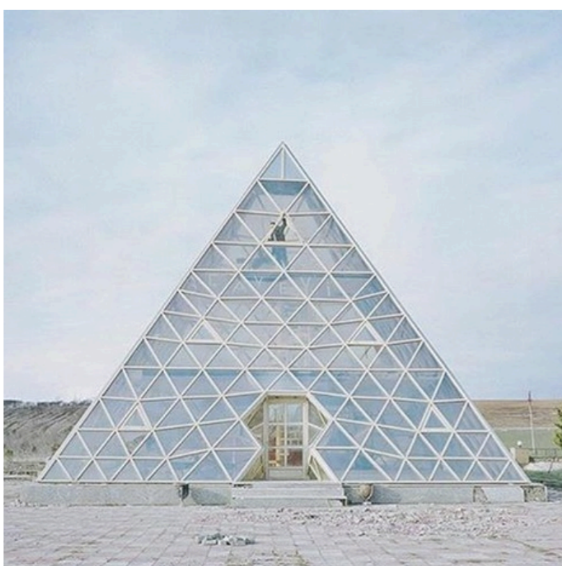
Glass is the key 🍷 #designtrends